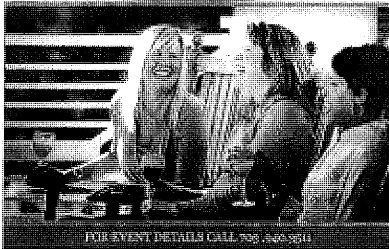
FOR EVENT DETAILS CALL 781.366.5311