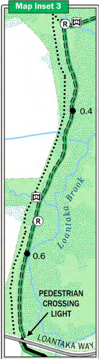
Map Inset 3