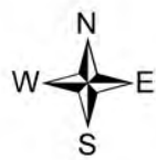
MAP INSET 2

Orange box = Burn Area Pink box = Closed Trail