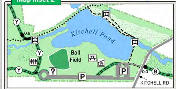
Map Inset 2

Trail Blaze Colors (B) Blue (R) Red (Y) Yellow