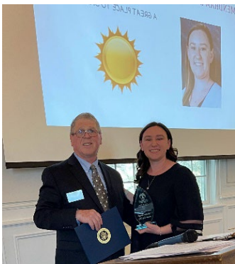
Community awards returned in 2022 – Mendham Borough summer camp

“Thank you so much for offering the environmental webinar to our students – they were excited and interested.”